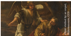
Elijah visited by an angel